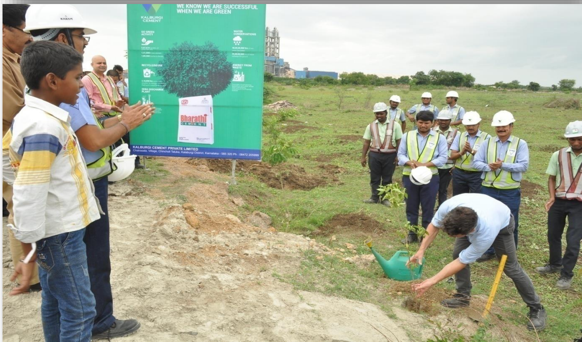
Mass plantation drive have been conducted by the management under Swatch Baharat Program near plant & mining lease area.