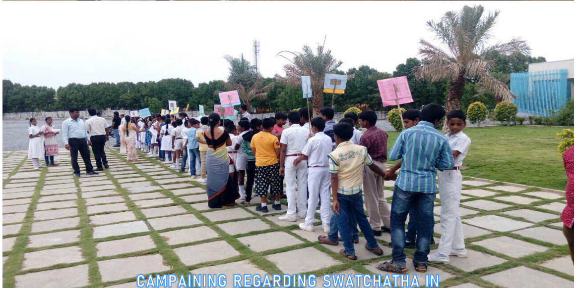
CAMPAINING REGARDING SWATCHATHA IN CHATRASALA VILLAGE BY SCHOOL CHILDREN