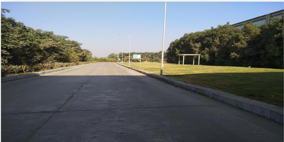
HOUSE KEEPING NEAR ENTRANCE GATE & PLANT INSIDE ROADS