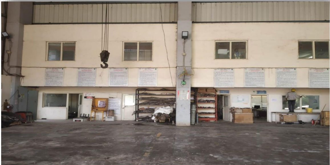
HOUSE KEEPING AT MINES WORKSHOP AREA