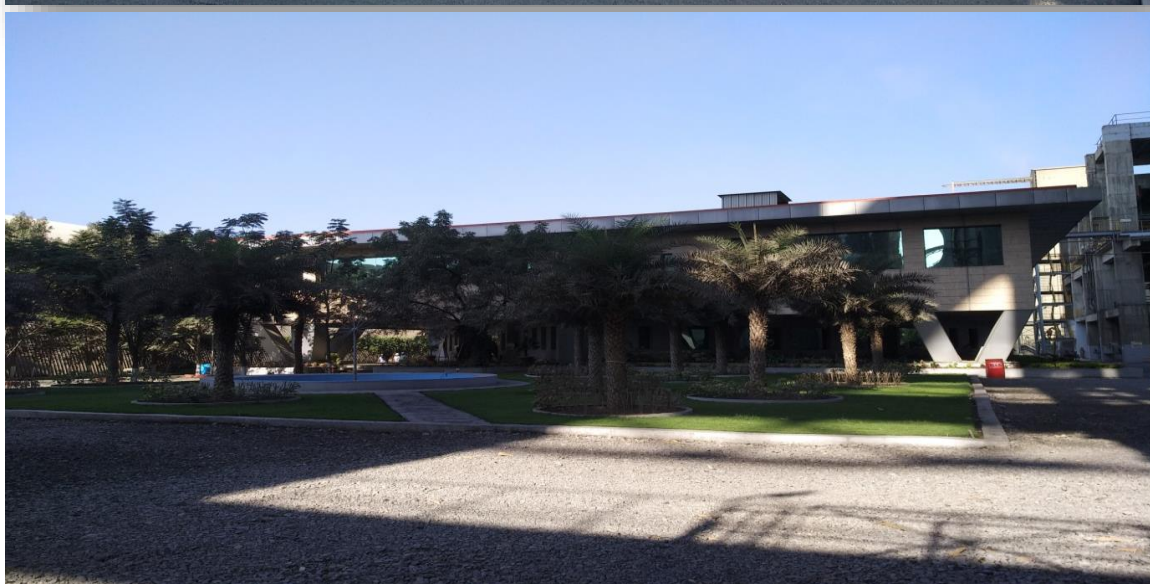
HOUSE KEEPING NEAR KILN & CCR AREA